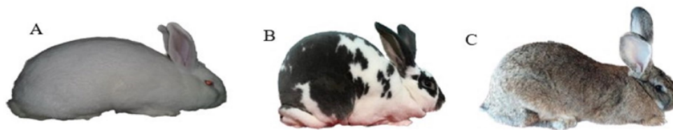
Fig. 1. Three breeds of rabbit used in the study: A, New Zealand Grade; B, Rex; C, Flamish Giant.

Preliminary analysis has been conducted to test the sexual dimorphism among male and female rabbits. Female semi-commercial type showed lower all body measurements and body weight than which male ones. Female commercial type showed higher CD and BL and female FG showed higher CC and CD than their opposite. Further, the significant difference between males and female have found only on HP for semi-commercial type and HP and BL for commercial type. There was no variable difference between males and females FG (Table 1). Table 2, present the coefficient correlation between body measurement and body