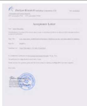
Acceptance Letter_14026593.jpg 414K