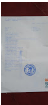
WhatsApp Image 2022-05-13 at 10.25.09 AM.jpeg 60K